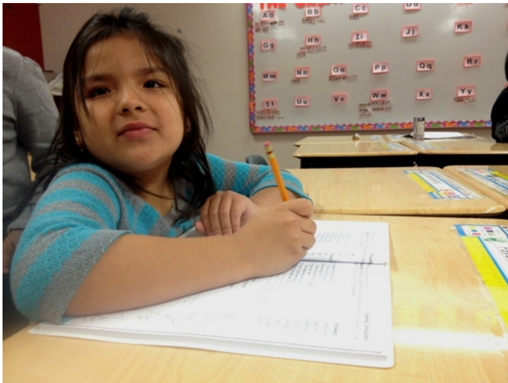
Mizhakiwetung Memorial School students will be taught how to perform CPR. (File photo)

Lifesaving skills are being taught at schools in Whitedog and Grassy Narrows this week.